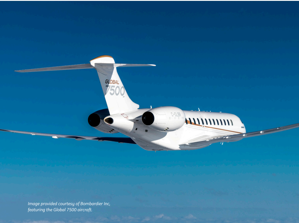
featuring the Global 7500 aircraft.

Setting new standards for ultra-long range business jet reliability and efficiency.