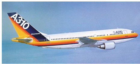
Airbus Industrie A310-200 Adv/300