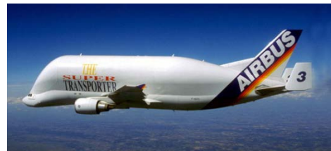
Airbus Industrie A300-600ST