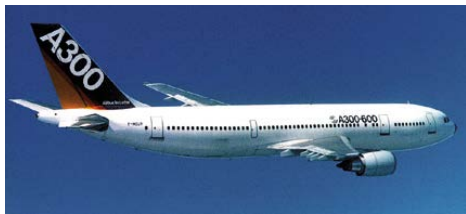
Airbus Industrie A300-600/600R/600F