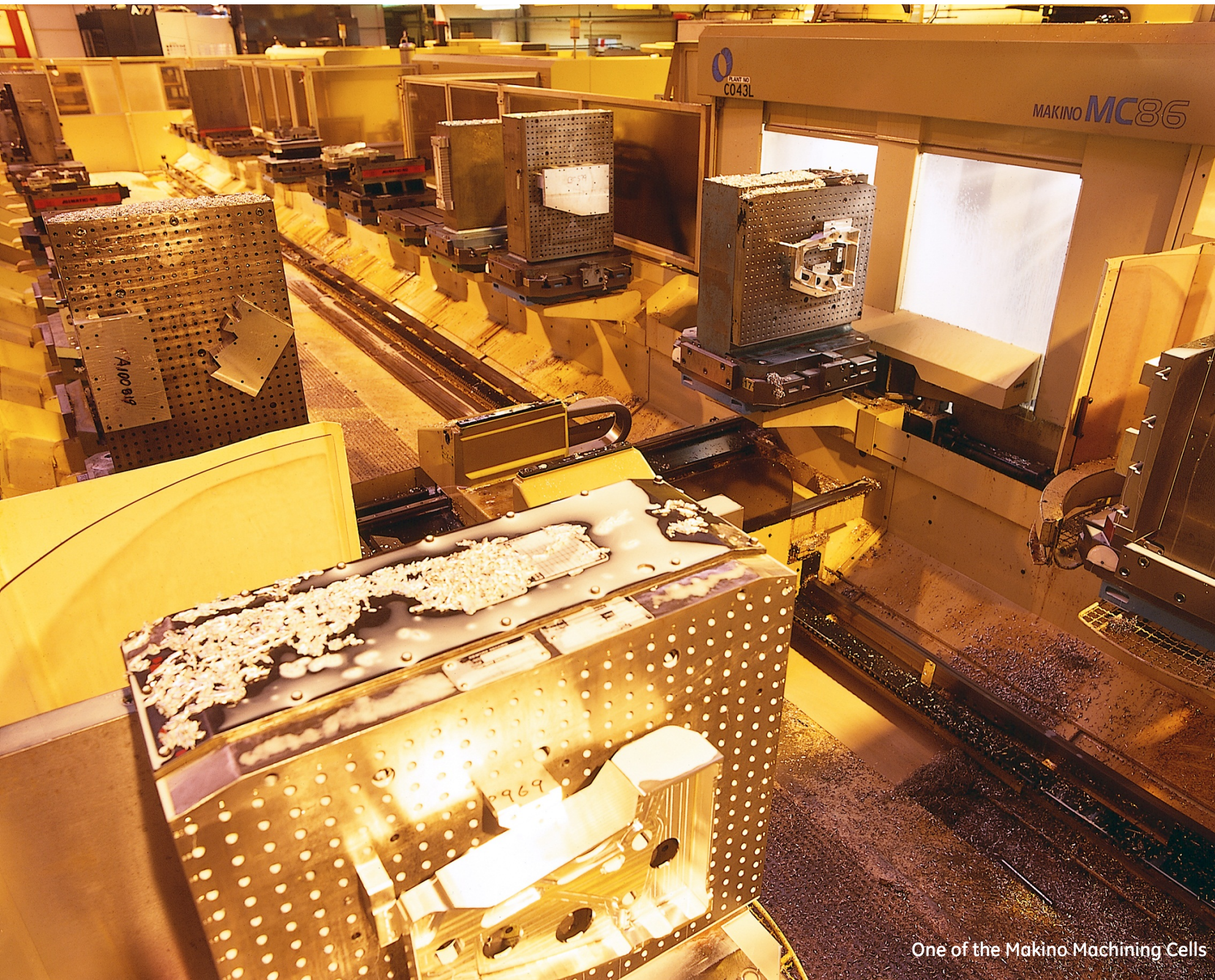
One of the Makino Machining Cells

GE Aviation's transparency business is a premier manufacturer and supplier of military aircraft canopies and windscreens, and has the capability to design, manufacture and deliver complete canopy assemblies in frame, encompassing full release actuation mechanisms. It also provides a full repair and overhaul facility for its manufactured items, supported by both design and R&D for future product development.