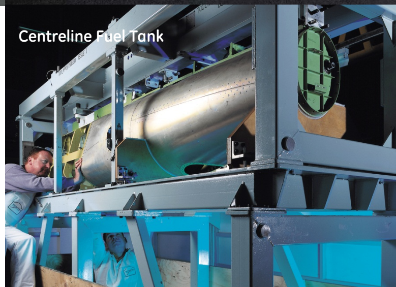
Centreline Fuel Tank

The company also oversees an extensive supply chain for the various components produced and supplied by other companies. GE Aviation, Hamble also assembles and integrates the engine mount unit in the nacelle, which is supplied by Bombardier.