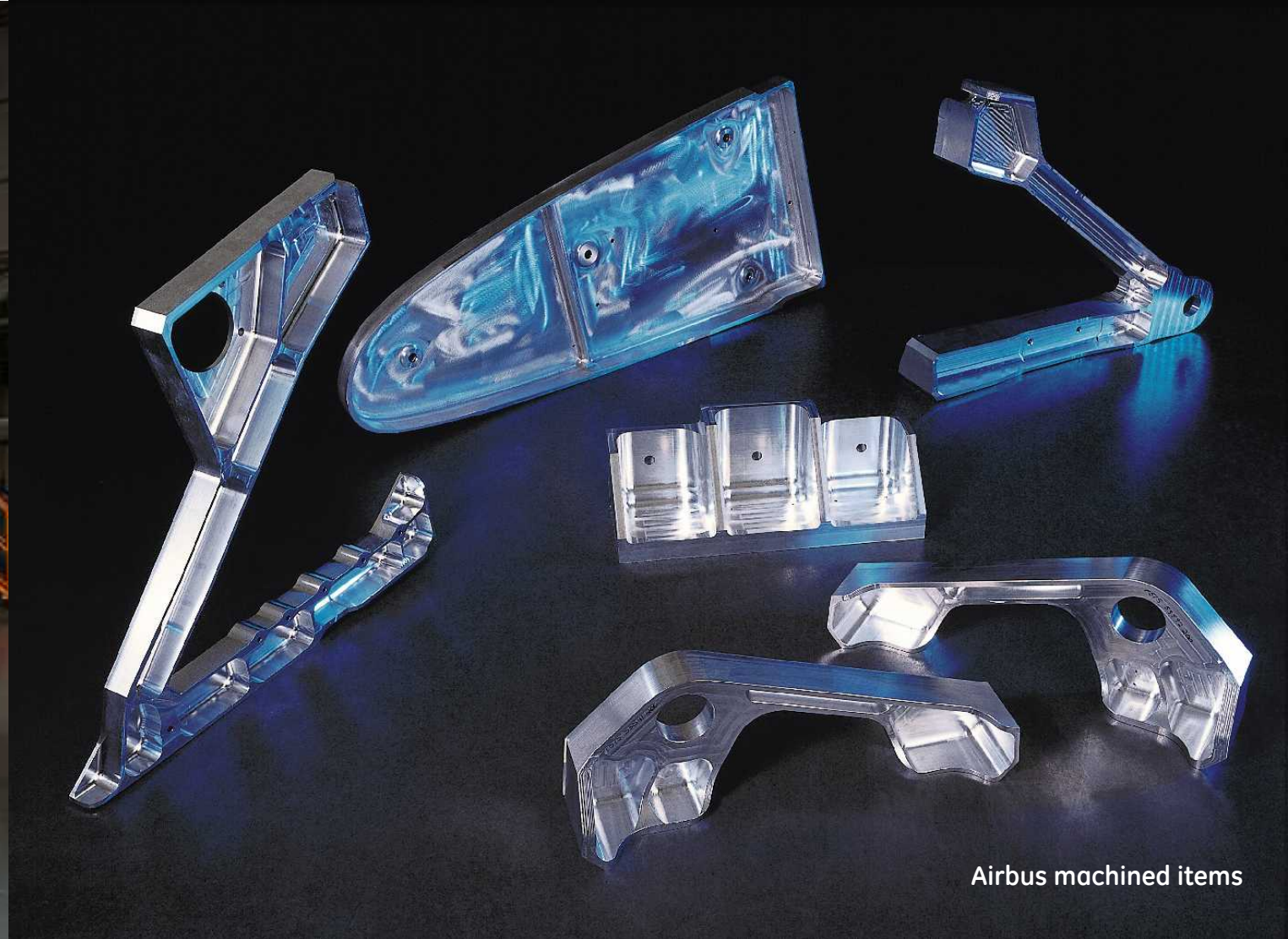
Airbus machined items