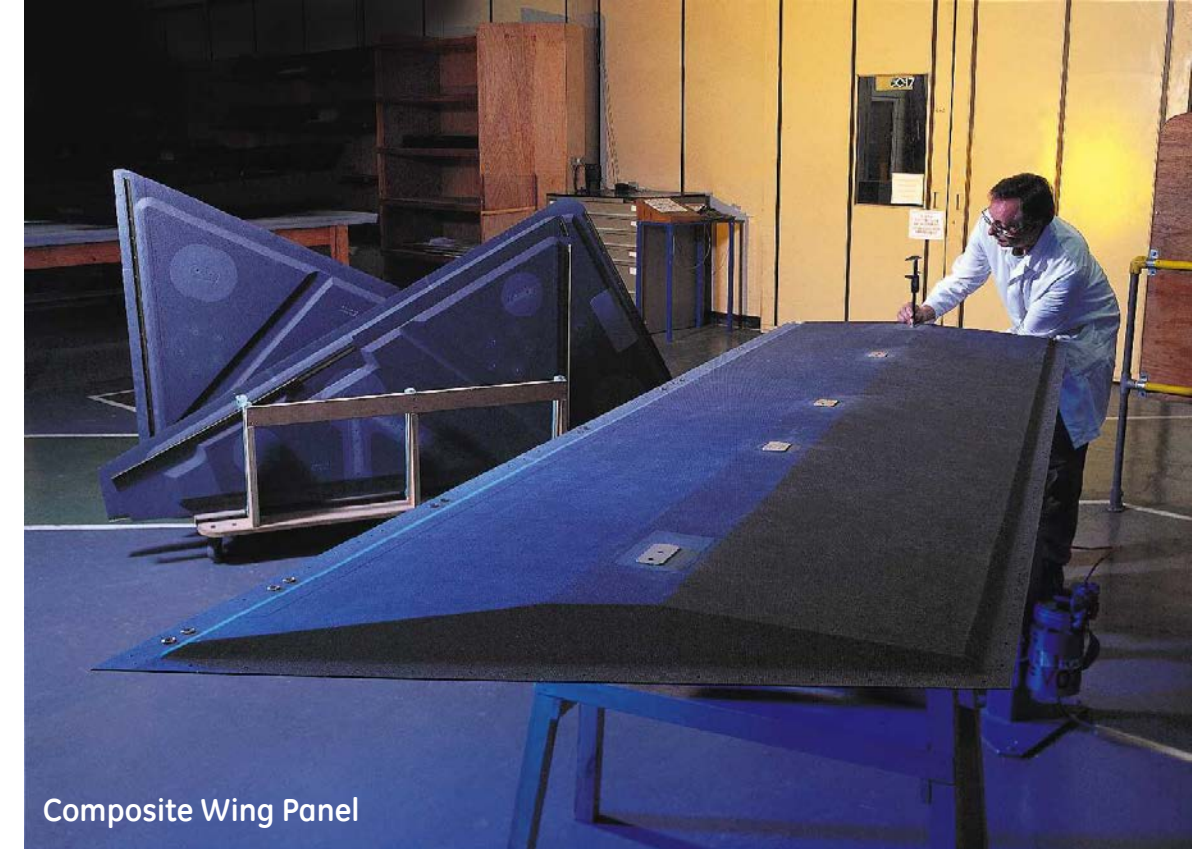
Composite Wing Panel

The composite department is housed in a modern well equipped facility and includes CNC cutting of pre-preg kits, large temperature and humidity controlled clean-rooms, vacuum curing ovens, five autoclaves (largest 3.65m diameter x 9.14m length), 5-axis CNC machines, co-ordinate measuring machines, Non-destructive Testing facilities and a paint shop.