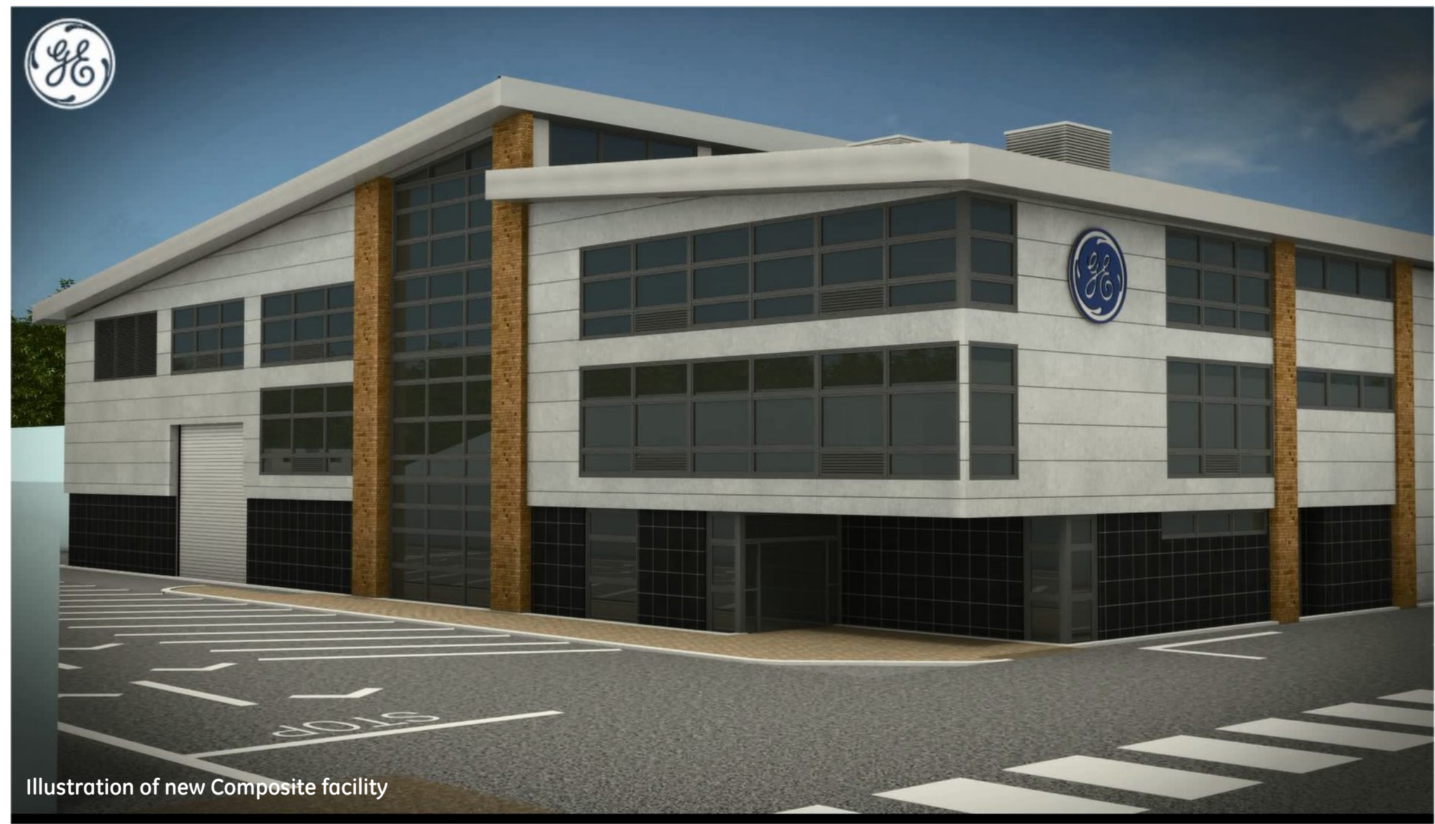
Illustration of new Composite facility

The new composites facility is based on a sustainable building concept that includes a 2,000-square-meter clean room, two autoclaves, four large curing ovens for out-of-autoclave composites production, five-axis machine tools, non-destructive testing facilities, along with offices for administrative and engineering personnel