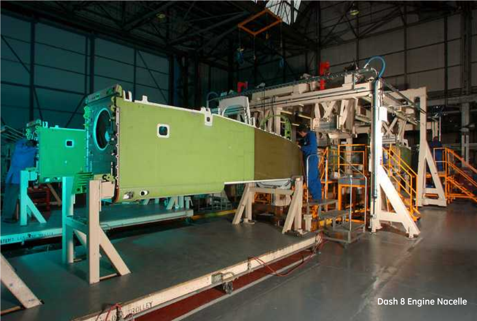
Dash 8 Engine Nacelle