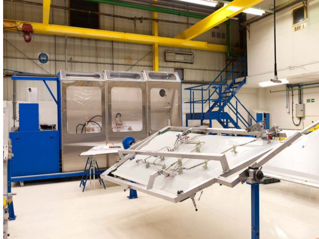
A350 Composite Panel and Rib

The A320 products involve high rate production composite components for the A320 Family of single-aisle aircraft. The seal plates are of a monolithic carbon configuration, while the fillet fairing is of a Kevlar panel design.